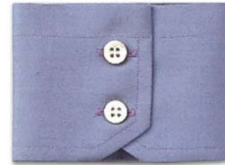
KS-4 2 Button Cuff Angle