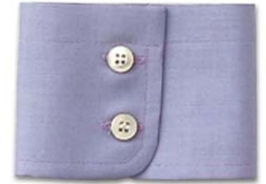
KS-5 2 Button Cuff Rounded Cut