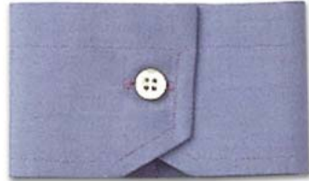
KS-2 1 Button Cuff Angle Cut