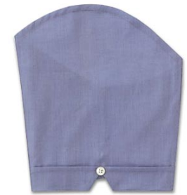
SS-3 Cuffed and V Cut