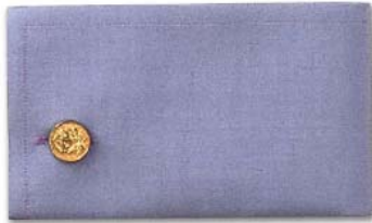
KS-6 French Cuff Square