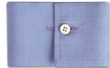
KS-9 Convertible Cuff