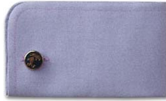
KS-7 French Cuff Rounded