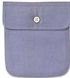
PS-3 Reg. with Flap & Buttons