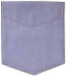
PS-1 Classic Pocket