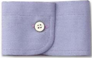
KS-1 1 Button Cuff Rounded