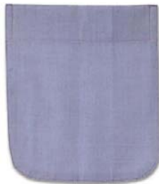
PS-2 Rounded Pocket