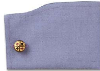
KS-8 French Cuff Contoured